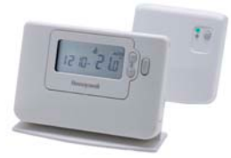
CM727 & CM721 1 & 7 Day Programmable Thermostats