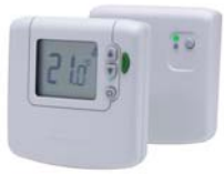
DT92 Digital Room Thermostat

These controls can be used to operate a boiler more efficiently using wireless connections.