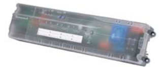
HCE80 Underfloor Heating Controller