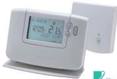
CM957* Modulating Programmable Room Thermostat