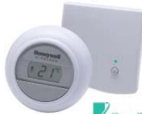
Y87RF* Modulating Room Thermostat