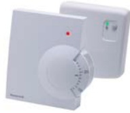
Y6630D Analogue Room Thermostat