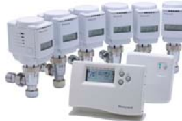
CM Zone Zoning System