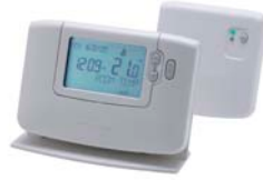
CM927 & CM921 1 & 7 Day Programmable Thermostats